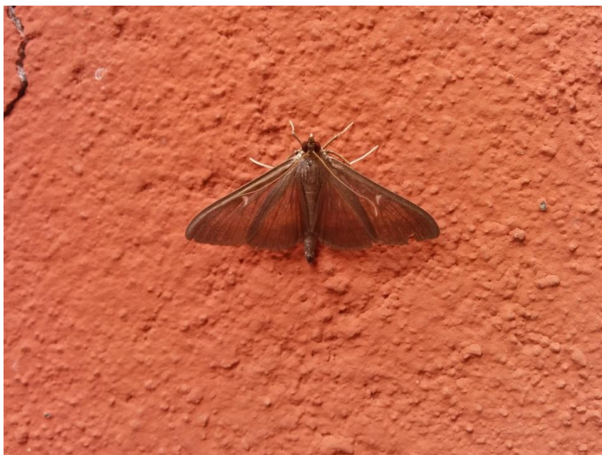
Fig. 6. Melanic specimen of C. perspectalis on a wall at the Village of Bargone (August 2016).

On 31 st August, at Pian del Lago (GE), at 700 m. a.s.l. near the marsh of Monte Roccagrande, Buxus plants were leaves-rich, but by a more accurate inspection we found some caterpillars at different stages; the flight of non-melanic adults was considerable. There was then a displacement in the age distribution of moth populations set at slightly different altitudes, corresponding to a few degrees of difference in temperature. Adults were massively resting on Eupatorium cannabinum L. (cf. Pinzari et al. 2015), known nectar plant for Euplagia quadripunctaria (Poda, 1761) too, a priority species under conservation according to Annex. II of Habitats Directive 92/43 EC, possibly ecologically displaced by the crambid. In fact, during our inspections E. quadripunctaria was never observed despite the fact in previous years numerous individuals had frequently been observed in the site.