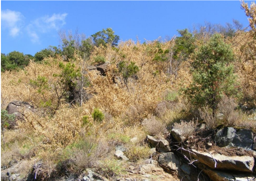
Fig. 4. Significant damage caused by C. perspectalis to the Box tree, dominant species of the Habitat 5110, in the SAC IT1342806 (July 2016).