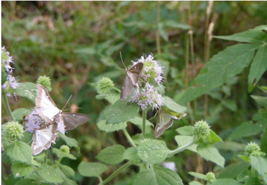
Fig. 1. Adults of C. perspectalis and some melanic specimens