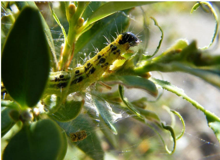
Fig. 3. Larva of C. perspectalis and its damage on leaves and young twigs of Buxus tree

Visual inspections following also the so-called “walking census method” and attention was dedicated also to spotting eggs and other juvenile instars of the pest on Box plants (Jervis & Kidd, 1996).