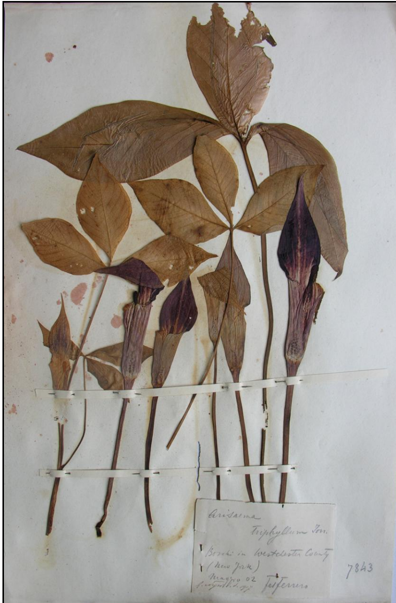
Figure 4. North American herbarium specimen of Arisaema triphyllum conserved in TO, collected by Felice Ferrero (02/05/1907).