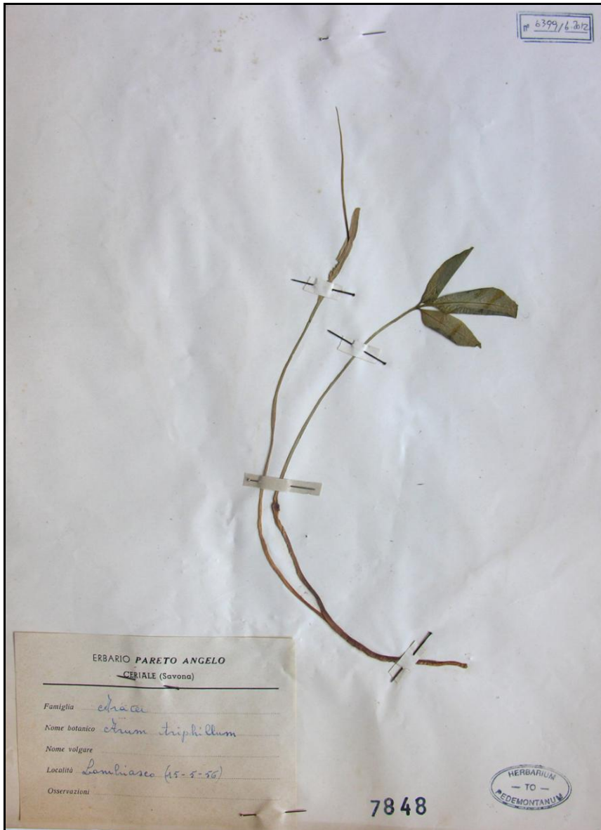
Figure 5. Herbarium specimen of Pinellia ternata (sub Arum triphyllum ) newly acquired in TO, collected in 1956 by A. Pareto near the River Po at Lombriasco (Province of Turin).