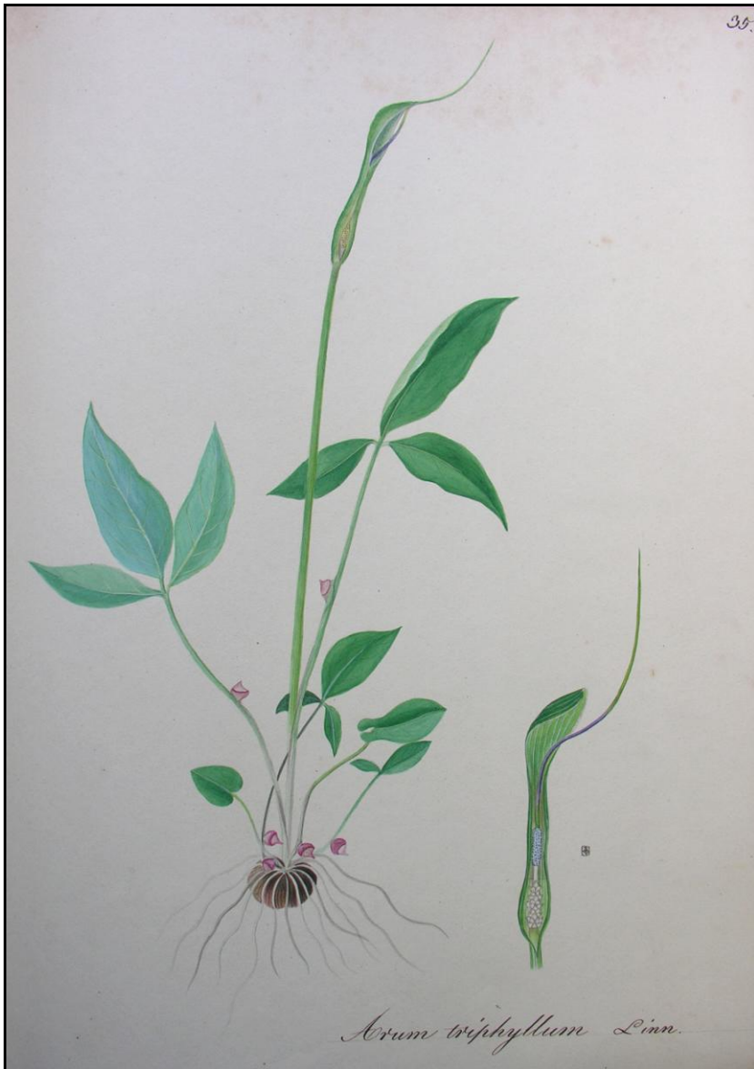
Figure 3. Illustrated plate of Pinellia ternata (sub Arum triphyllum ) from Iconographia Taurinensis (t35, vol. 55) conserved in the Library of Department of Life Sciences and Systems Biology (University of Turin).