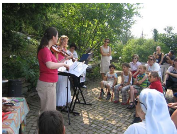
Fig. 3 and 4 . Talks for adults and musical plays for children during Midsummer events.

In the three past editions several activities were autonomously organized in all the nodes of the Network: