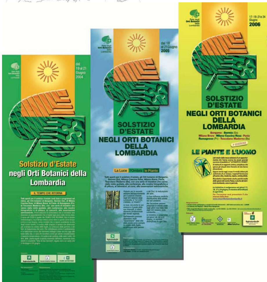
Fig.2 – Posters of past editions of “Midsummer Solstice at the Botanic Gardens of Lombardy”

The Network works to attain shared objectives and every year since 2004 promotes the “Midsummer Solstice at the Botanic Gardens of Lombardy”, an important event open to the public from the whole region.