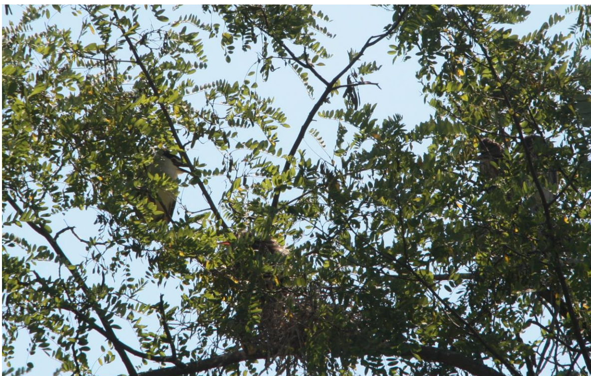
Figure 3. San Giuseppe di Cairo: Black-crowned Night-heron with chicks (10 July 2022).

As reported in other studies (e.g.: Beraudo & Caula, 2014) in this mixed species heronry, Night-herons occupied the lower levels of the trees and Grey herons the canopy, while the Little Egrets nested at mid-level height.