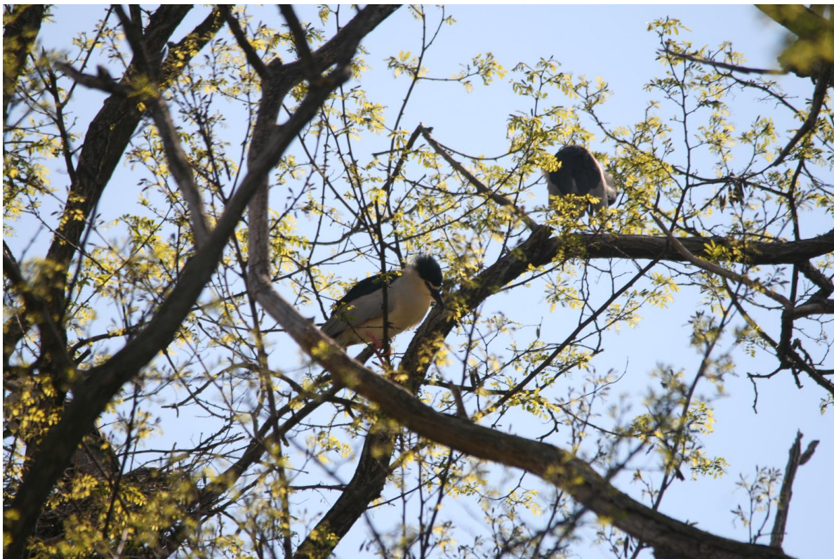
Figure 2. San Giuseppe di Cairo: Black-crowned Night-herons displaying (03 May 2022).

On the 20 th of April, the first four individuals of Little Egrets were seen, two of them already on nests. Since then, the site was monitored regularly, with at least one survey every 10 days from April to July. On the 1 st of May the first six Night-herons were observed bringing nesting material and performing courtship displays (Figure 2).