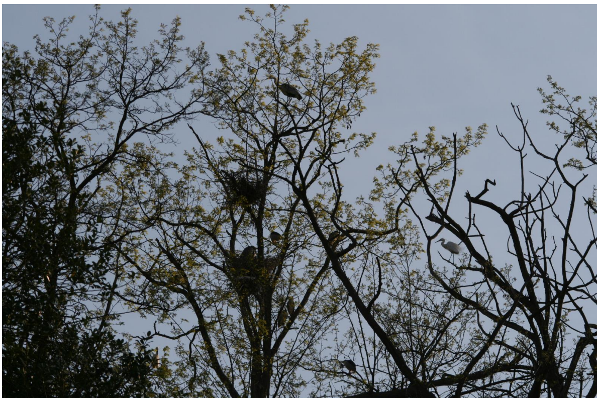
Figure 1. The heronry in San Giuseppe di Cairo (03 May 2022).

During the spring 2022 we observed the first breeding pairs of Black-crowned Night-heron and Little Egret. The nesting site was located in the western part of the region, in San Giuseppe di Cairo, in the inland of the Savona province (Figure 1). The heronry was at an elevation of approximately 340 m along the Bormida river, close to an artificial dam in a very anthropized site, characterized by urban settlements. The nests were built on Black locust trees Robinia pseudoacacia , similarly to heronries in other areas of Northern Italy (Bricchetti & Fracasso, 2003).